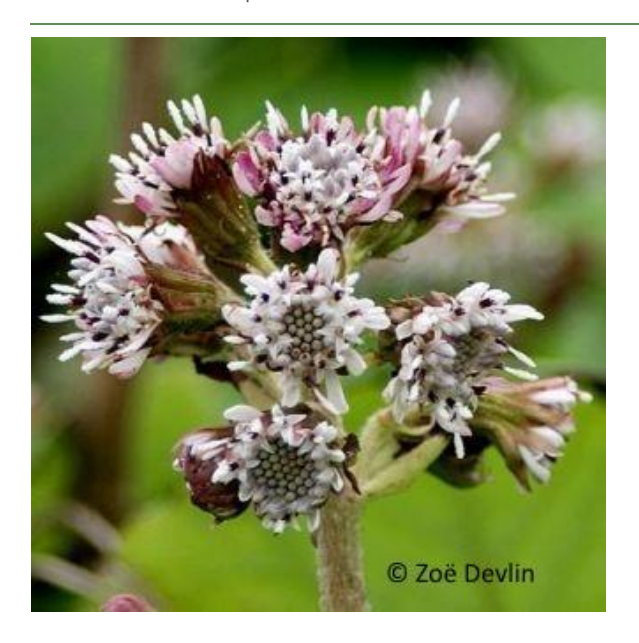
Figure 7 Winter Heliotrope