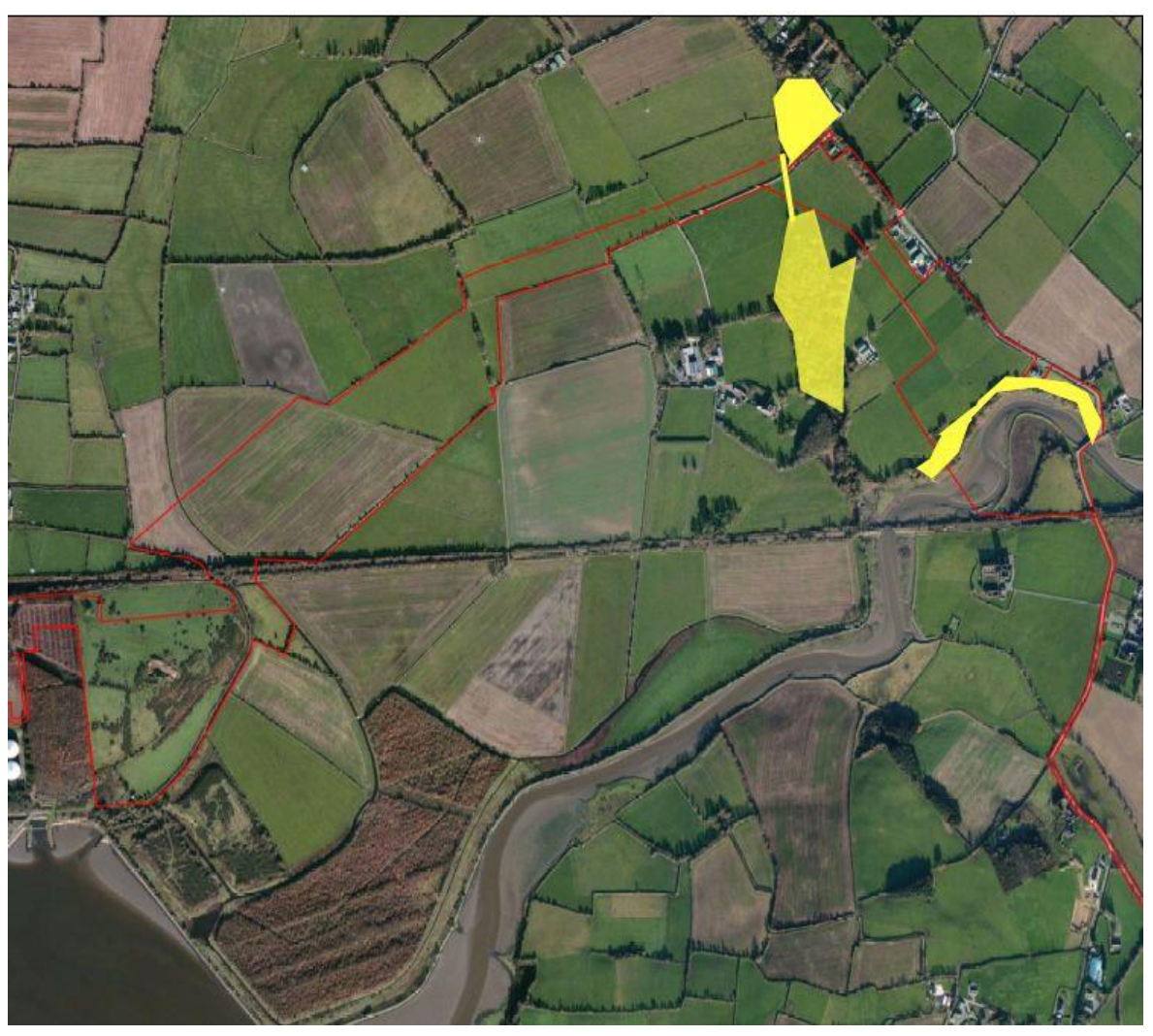
Figure 3 Location of Rhododendron | not to scale