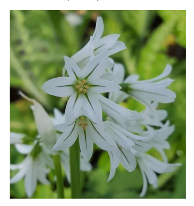
Figure 6: Three-Cornered Leek

commencement of works to ascertain if the distribution of this species has changed, the supervising ecologist will update this ISMP as required based on up to date data.