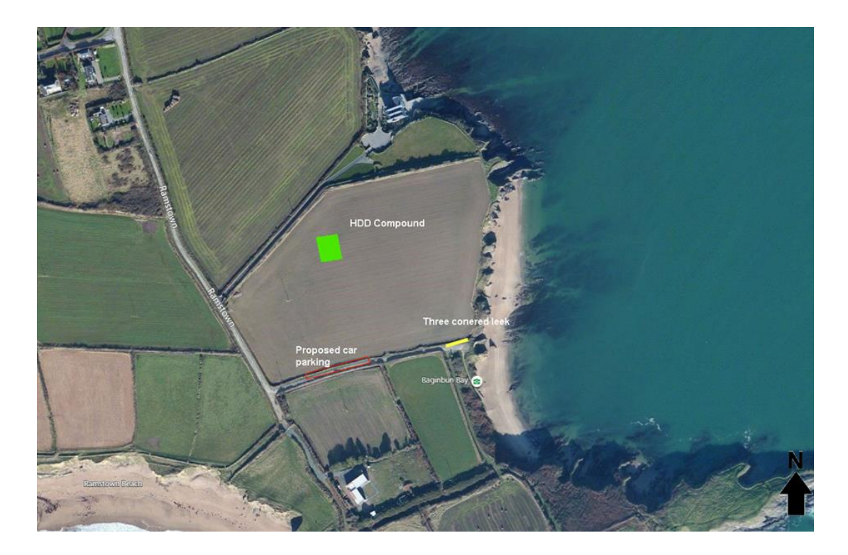
Figure 2 Location of Three-cornered Leek | not to scale