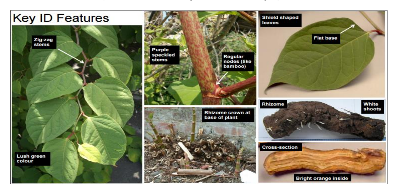
Figure 5. Key features of Japanese Knotweed

The plant has woody underground rhizomes which can extend 7m laterally from a parent plant. The leaves and stems die back during winter, but growth is extremely rapid during spring. The plants spread mainly through fragments of rhizomes -as little as 0.7g of material or the size of a small fingernail is sufficient-and through cut stems. Stem material cannot regenerate once it has dried, but rhizome material may be viable for up to 20 years in the soil. Thus, control of this species is very difficult. The characteristics of this species is shown in Figure 4 and Photographs 2 and 3.