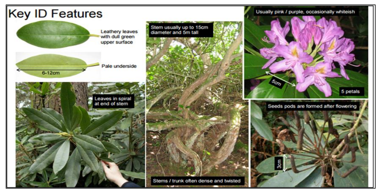
Figure 4. Key features of Rhododendron.

this species are illustrated in Figure 2 & Photographs 1 . Within the study area this species is strongly associated with woodland and hedgerow habitat.